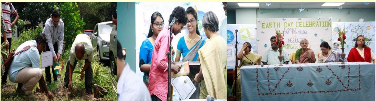
Tree Plantation, their Conservation and Celebrated Earth's Day, Quiz, Cultural programs -2019