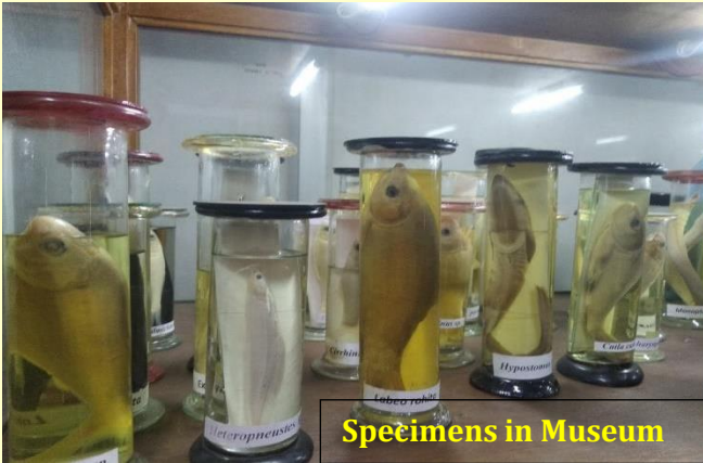
Specimens in Museum