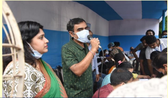
Annual Sports meet 2022