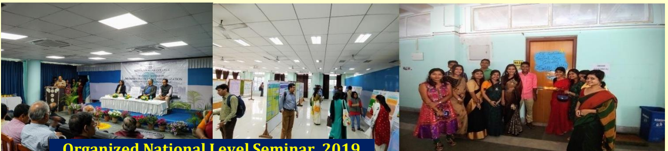
Organized National Level Seminar, 2019