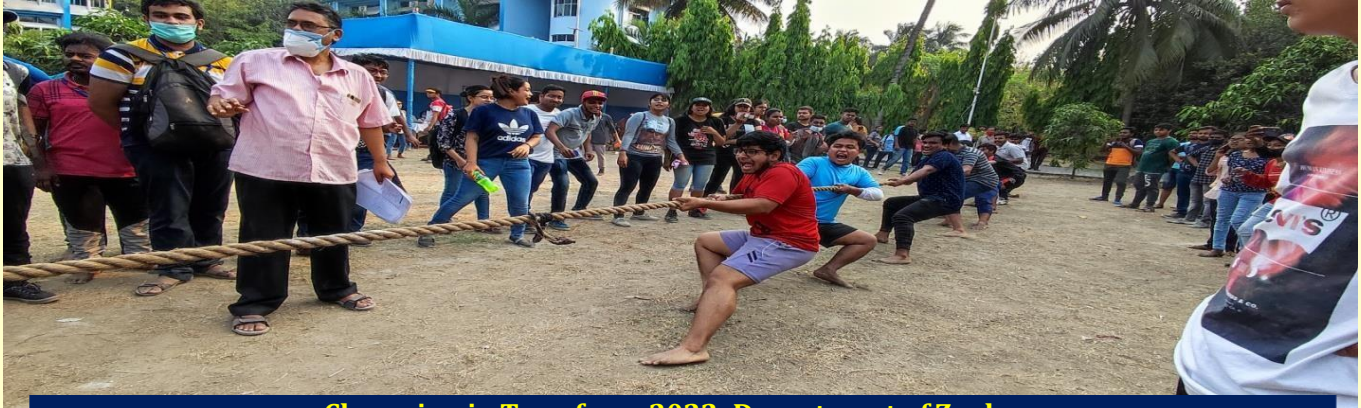
Champion in Tug of war 2022: Department of Zoology