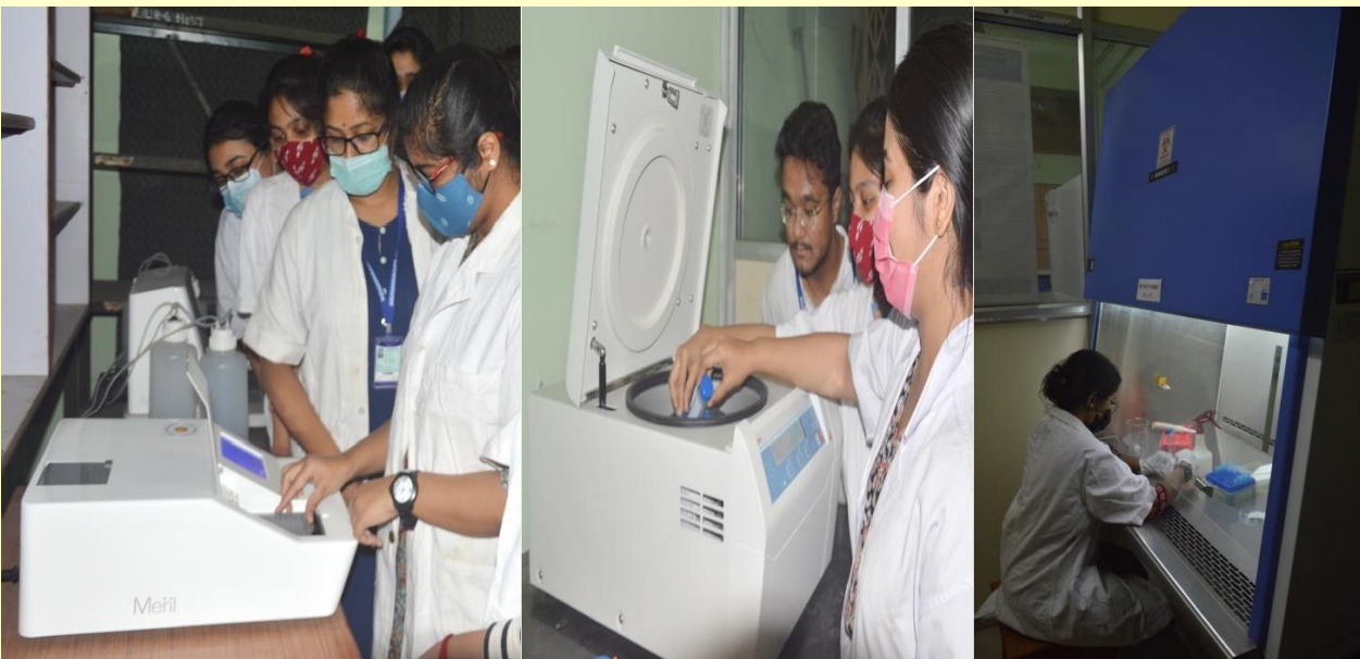
PG Students using different instruments during their practical class