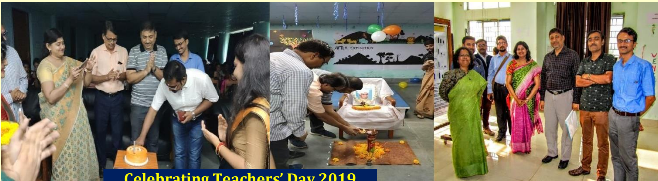
Celebrating Teachers' Day 2019