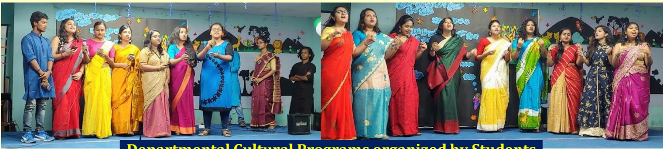
Departmental Cultural Programs organized by Students