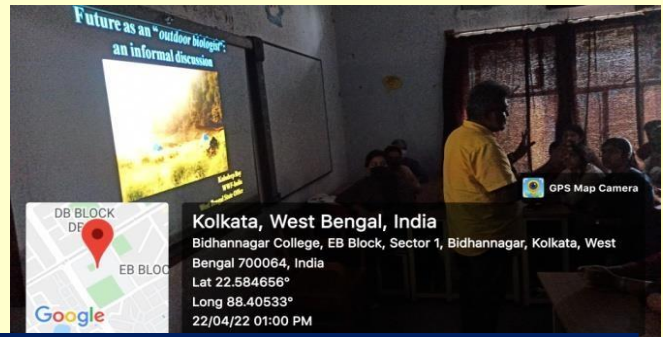
Departmental Seminar on Outdoor Ecology