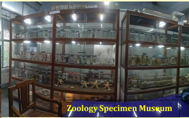
Zoology Specimen Museum