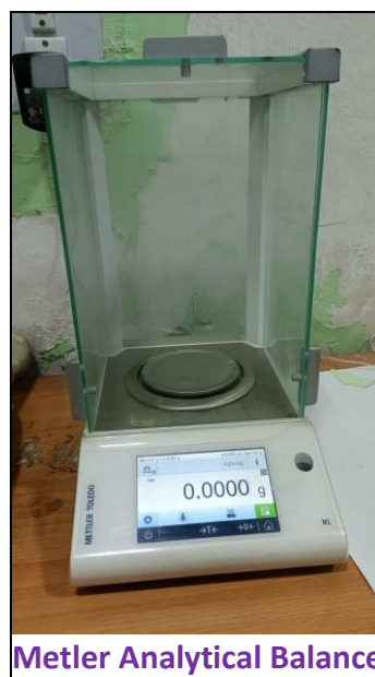
Metler Analytical Balance