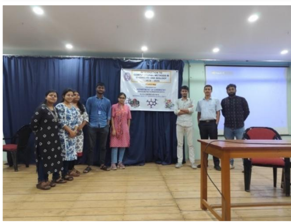
Workshop at Mrinalini Datta Mahavidyapith, Birati, North 24 Parganas